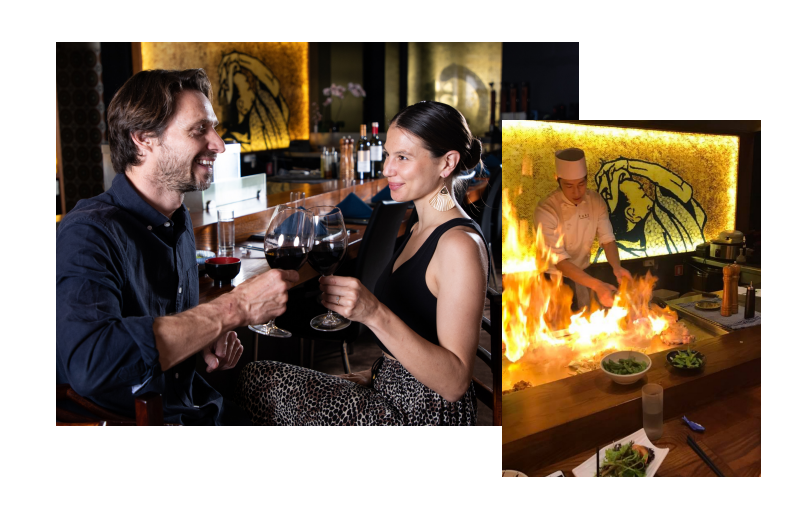
Teppanyaki Bar for birthdays or anniversaries

Ask one of our friendly staff for more details. Or visit our website tsunamisushi.com.au and click on 'functions'. Or scan QR code for details.