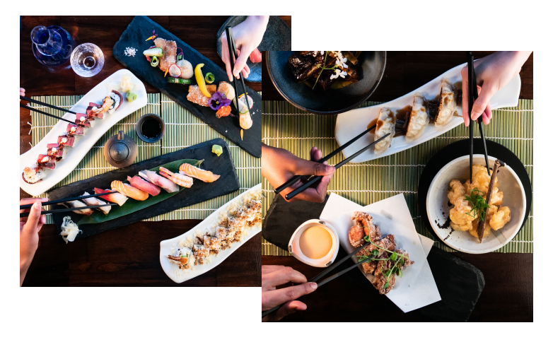
Shared table birthdays and special events